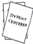
A 'zine is an informal publication