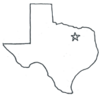
The Nasher Sculpture Center is an art museum in Dallas, Texas.

We are the Nasher Student Advisory Board. We love talking about contemporary art, creating art and meeting artists. We all live in or around Dallas, Texas and contribute to programming at the Nasher Sculpture Center