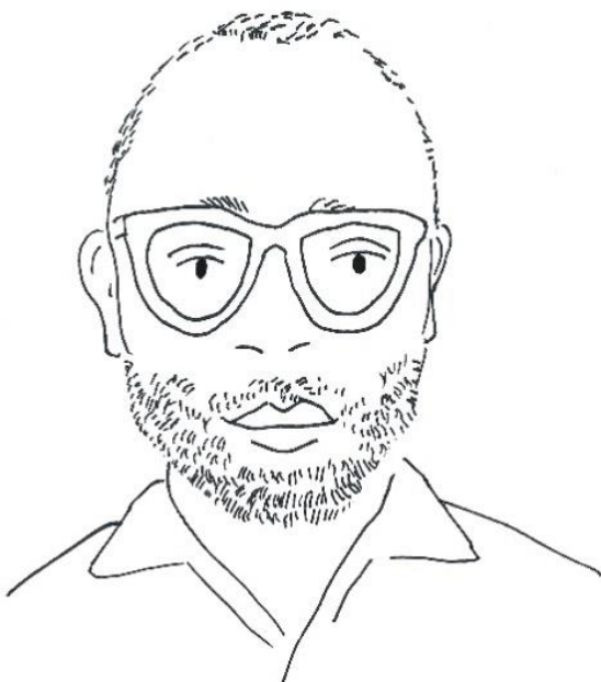
Theaster Gates, 2018 Nasher Prize Laureate

Gates's primary concern is space: "Even when I am restoring a building or making a painting, I am first considering the possibilities of space and then offering a different view." His curiosity and imagination have inspired him to explore ceramics, performance, sculpture, and transformative neighborhood projects in Chicago and around the world.